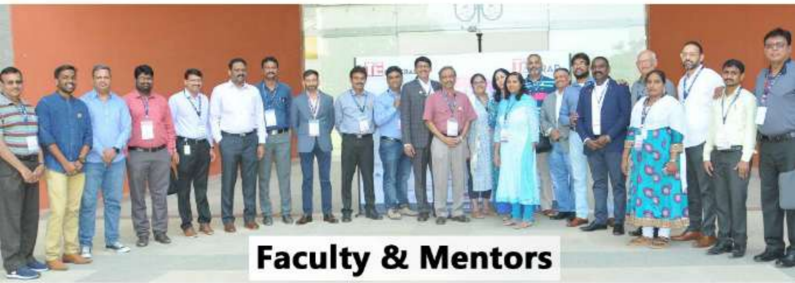
Faculty & Mentors